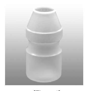
[Figure 1] The applied-for Yakult bottle

You may easily recall the unique shape of a "Yakult drink" Bottle. On November 16, 2010, the Intellectual Property High Court (hereinafter "IP High Court") issued a decision which held that the shape of the Yakult mini bottle without any words or distinctive elements (hereinafter "Yakult bottle," shown in Figure 1 below) has acquired a secondary meaning for the goods "lactic acid drinks" in Class 29. This is the second case following the recent Coca-Cola bottle case ((Gyo-ke) 10215/2007, IP High Court, May 29, 2008), which was successfully handled by Yuasa and Hara, where the Japanese IP High Court recognized the inherent distinctiveness of the shape of a container of the products. In this decision, similar to the Coca-Cola bottle case, the IP High Court judged that the shape of the Yakult bottle has acquired a secondary meaning, though the famous word mark "Yakult" in Katakana or in Roman letters is shown in an eye-catching manner on the actual Yakult bottles sold in the markets (see Figure 2 below). For the claimant Yakult Honsha Co., Ltd., it was the second attempt to register a three-dimensional trademark for the shape of a Yakult bottle, as the first try failed in 2000 ((Gyo-ke), 474/2000, IP High Court, July 17, 2001).